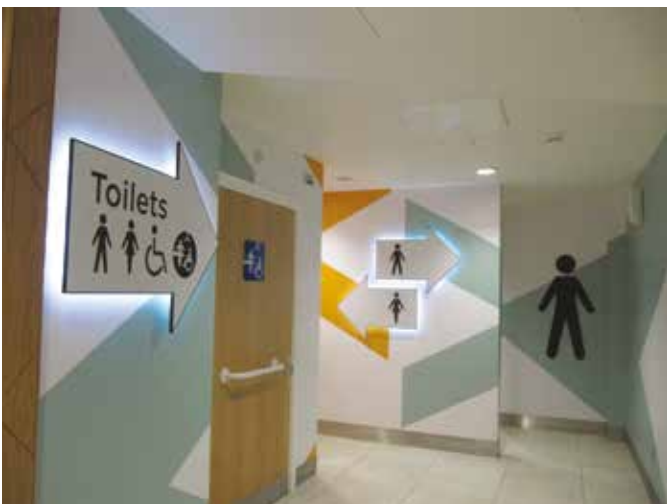
Exchange Shopping Centre Ilford