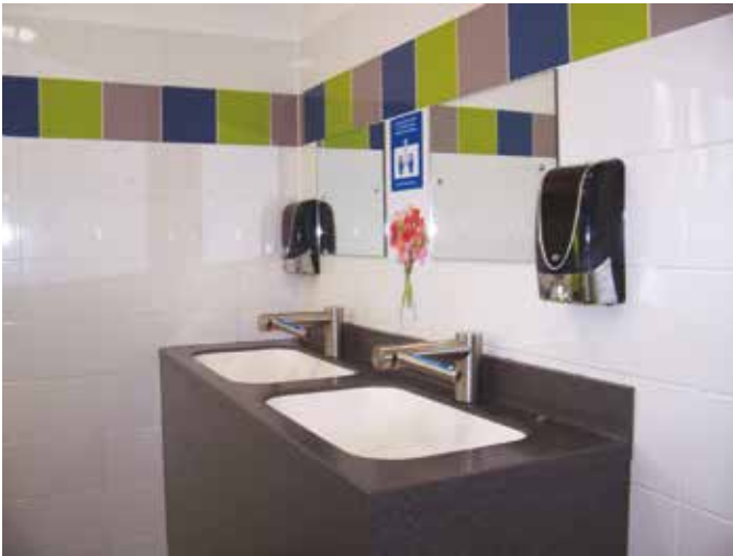
Church Close Wychavon DC