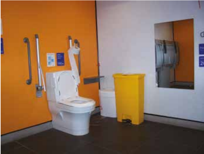
Intu The Potteries