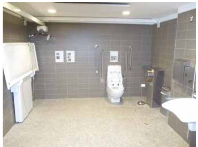
Victoria Square Shopping Centre Belfast