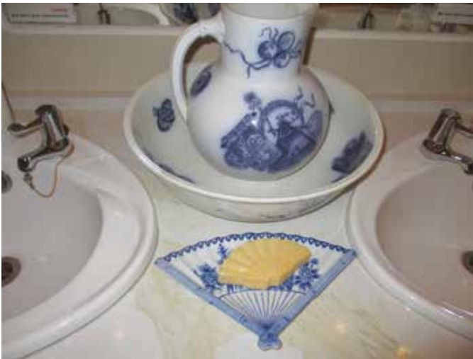
The Fan Museum Greewich