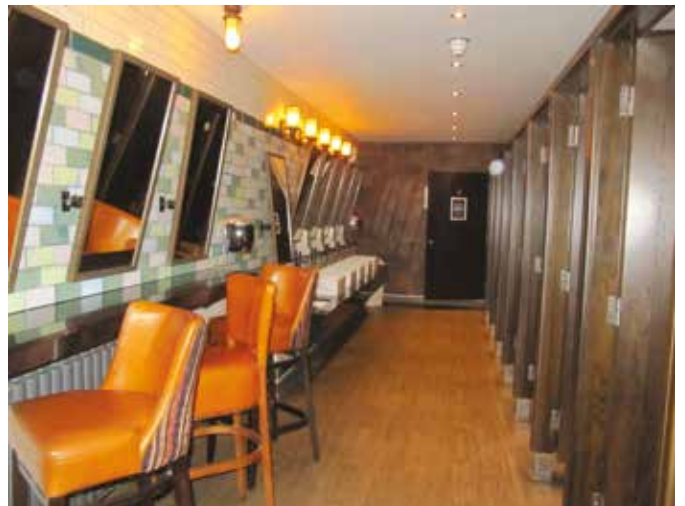
Swan and Angel JD Wetherspoon