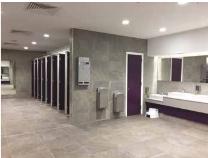
Trinity Shopping Centre Aberdeen