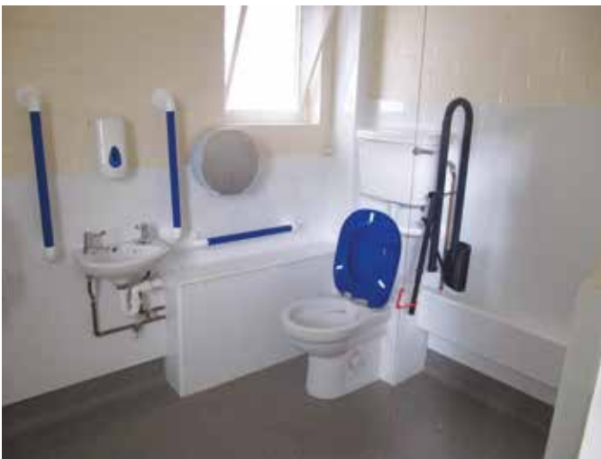
Rosehill Cemetery Oxford