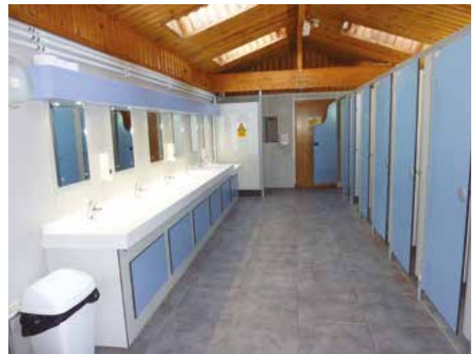
Shamba Holidays Ringwood