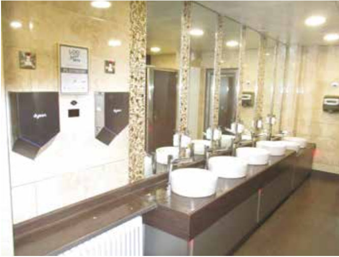
Buttercrane Centre Newry NI