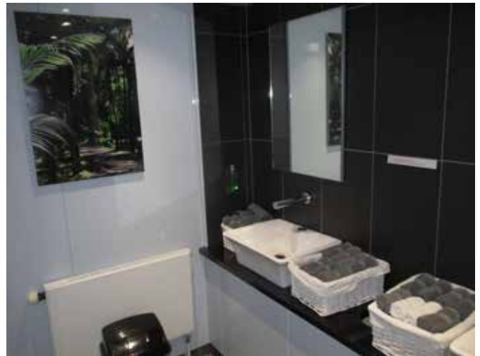
The Kings Fund London