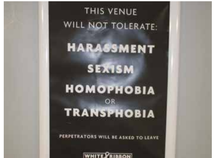
Islington Assembly Rooms London