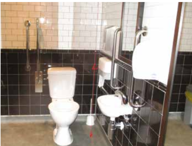
Silver Penny Dublin JD Wetherspoon