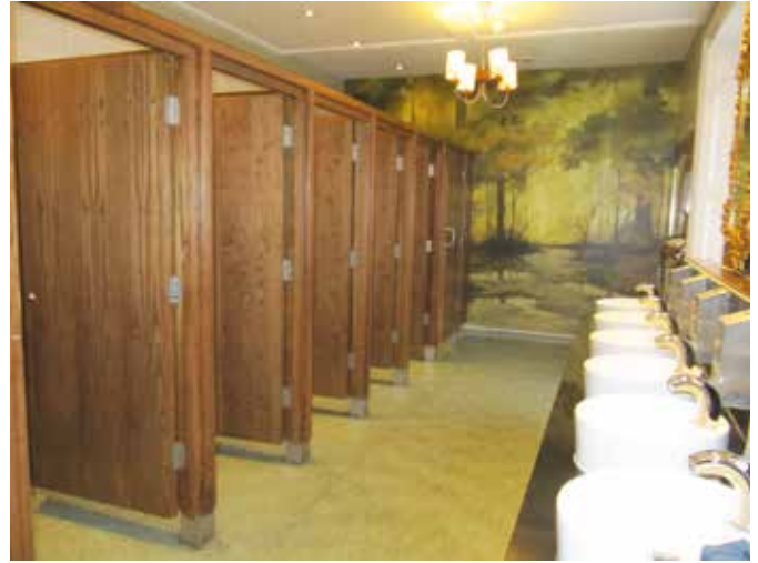
Captain Noel Newton JD Wetherspoon Oakham