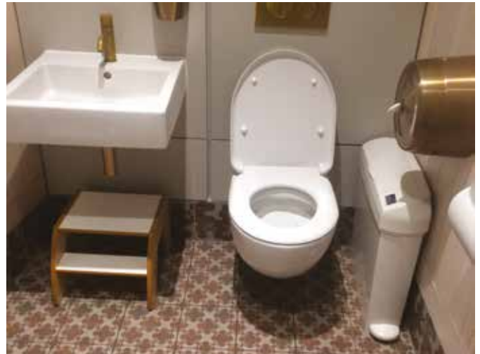
Holyrood Palace Edinburgh