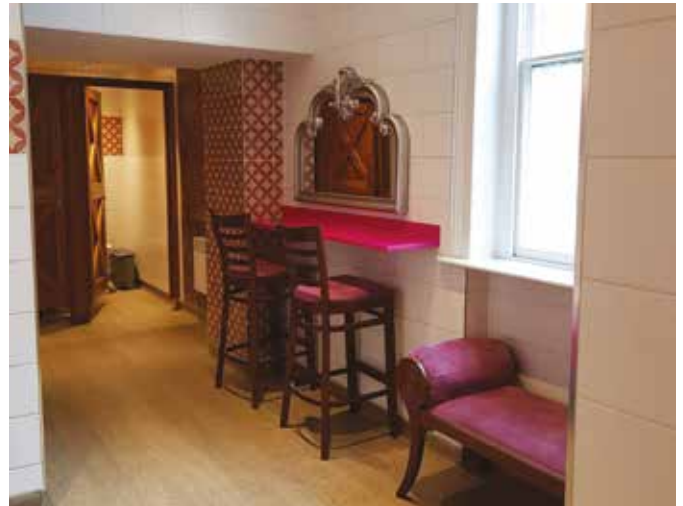
Dolphin & Anchor JD Wetherspoon Chichester